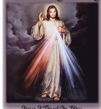
Jesus I Trust In You