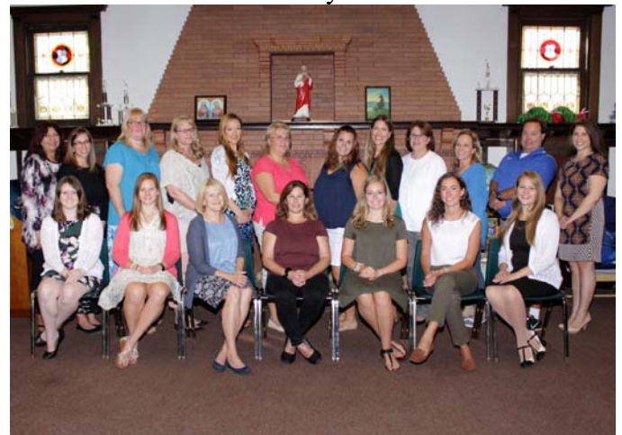
Sacred Heart School Faculty and Staff 2017-2018