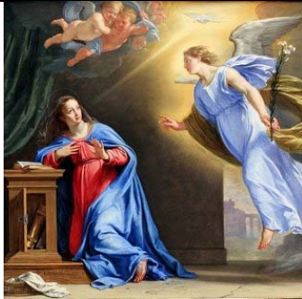
Prayer for Vocations